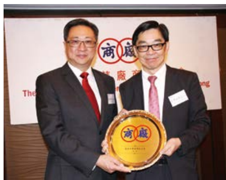
會董晚宴 (3 photos)