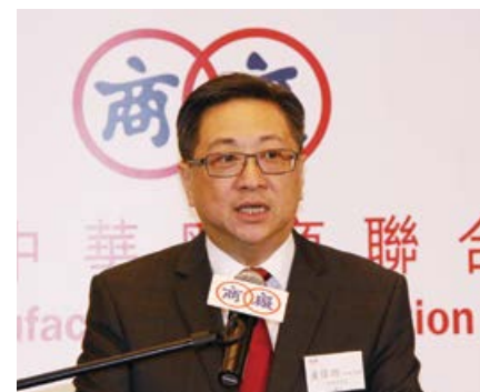
會員「樂」Bar - 紙品包裝業、印刷業、珠寶業委員會 (3 photos)